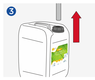
Carefully remove the dishwashing tube out of the GREEN'R Autodish S container.