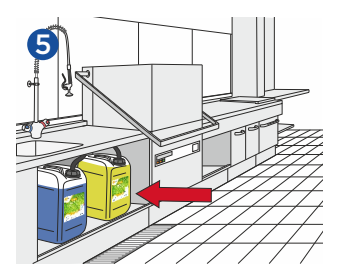
Put the GREEN'R Autodish S back by the dishwashing machine.