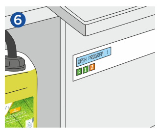
Run the dishwasher cycle to ensure the product is pulling through.