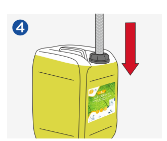
Place the tube into the new container of GREEN'R Autodish S.