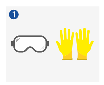
Wear correct PPE when changing dishwashing tubes.